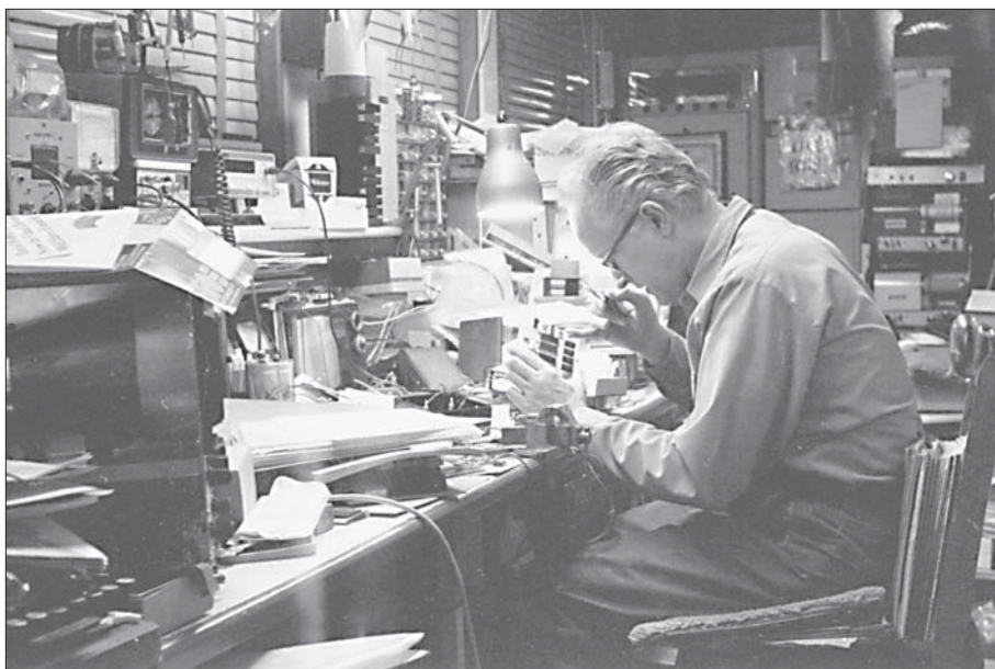
Figure 2: Robert Redfield works in his lab at Skokie, IL, during 1976.

worked to resolve circuit design nits. Prototype #1 did not contain the AM modulator as that was being designed in a separate, but parallel path, with the aim to be eventually integrated within the prototype. Wes didn't get everything he wanted right away with Ivanhoe , but prototype #1 was clearly heading down the right path.