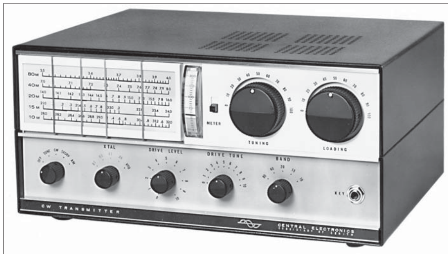
Figure 1: This is the new Novice rig's publicity photo and it shows how attractive the transmitter would have been.